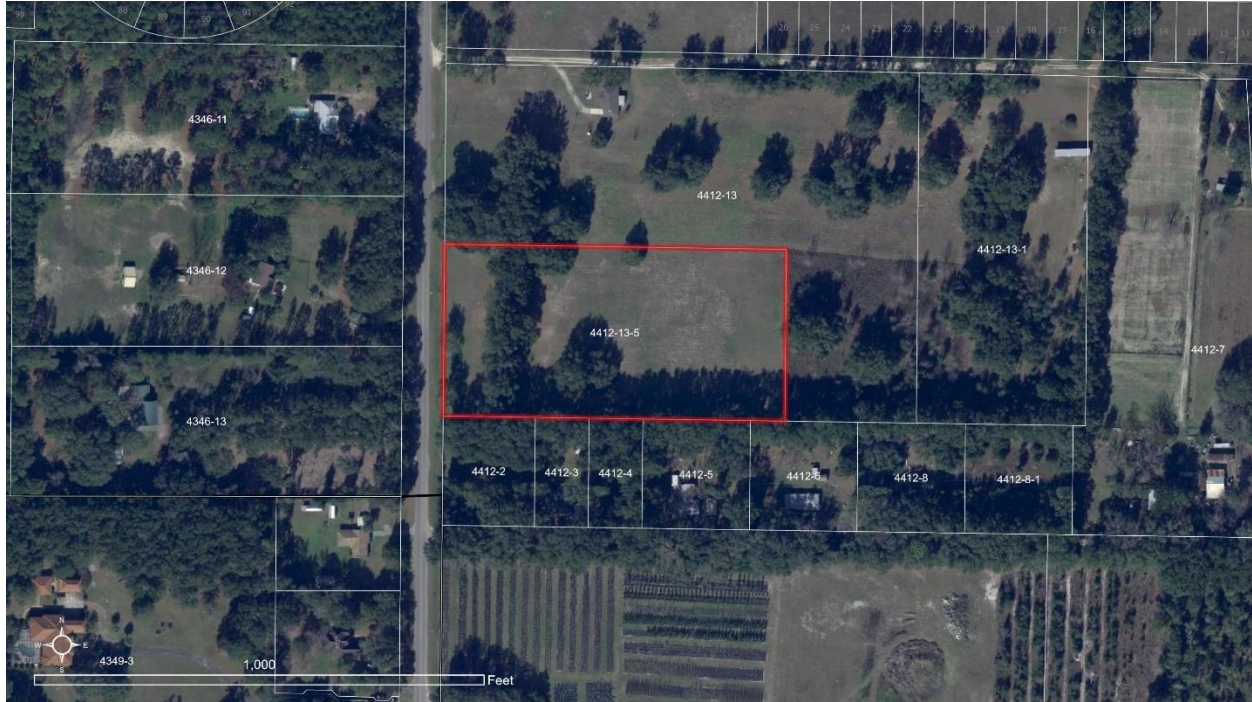
Figure 1 - Aerial map of site

This application is a request to rezone from RE-1 (residential, 1 dwelling unit per 2 acres to 2 dwelling units/acre) zoning district to R-1a (residential, 1-4 dwelling units/acre) district on a vacant parcel approximately 5.01 acres located along SW 143 rd St. If approved, the R-1a district would allow for single family uses (such as a subdivision) with a density up to 4 dwelling units/acre. The request has been sought by the applicant to increase the allowable number of units while maintaining consistency with the future land use designation of Low Density Residential (1 to 4 dwelling units/acre).