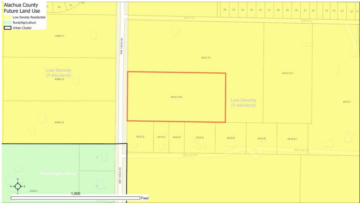
Figure 2- Future Land Use Map