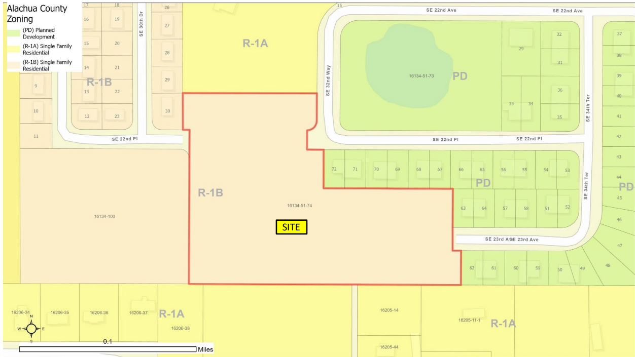
Figure 2 – Existing Zoning Map