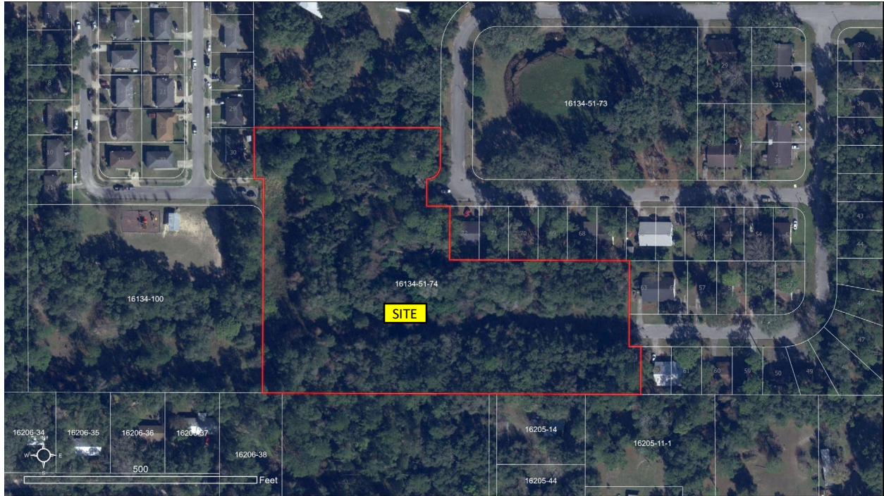
Figure 1 - Aerial map of site

parcel (Low-Density Residential) permits a residential density of 1-4 dwelling units per acre (du/acre). The existing zoning district of R-1b, at 4-8 du/acre, does not appropriately implement this future land use designation. The applicant is requesting a zoning change to R-1a (1-4 du/acre) that will appropriately implement this land use designation.