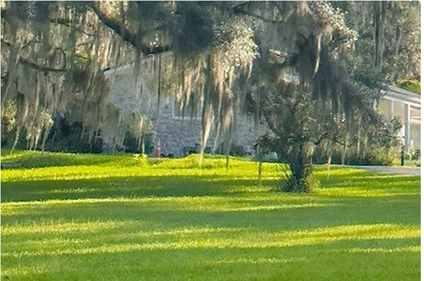
No Place Like Home • Lakeshore Drive