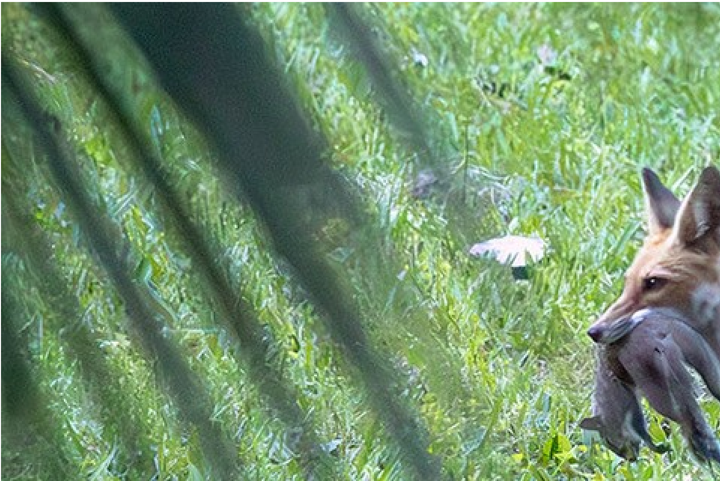
Cycle of Life • Lakeshore Drive