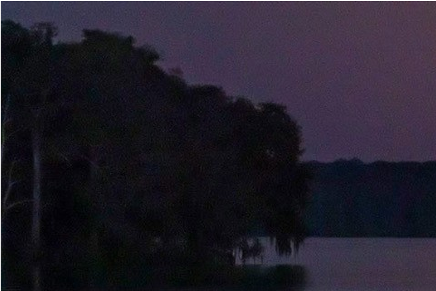
Pithlachocco Moonrise