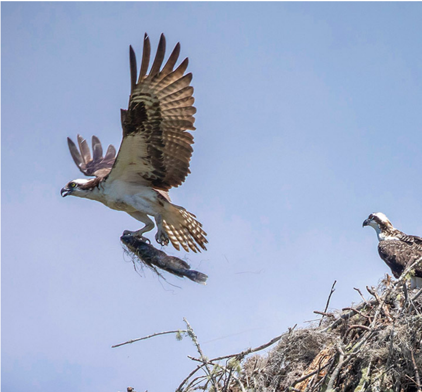
Flying Fish • Newnans Lake