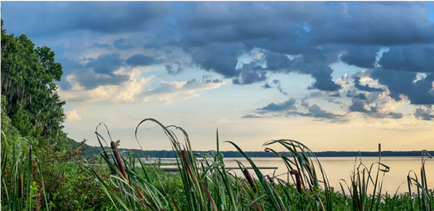
Pithlachocco Sunrise