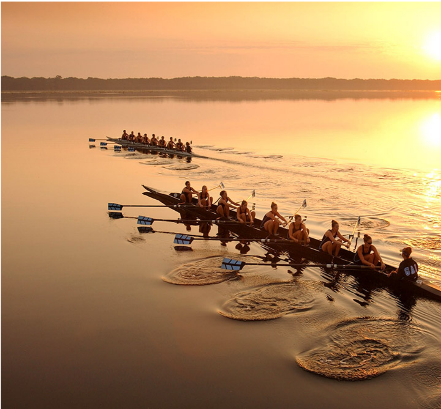
Joy of Rowing • Newnans Lake