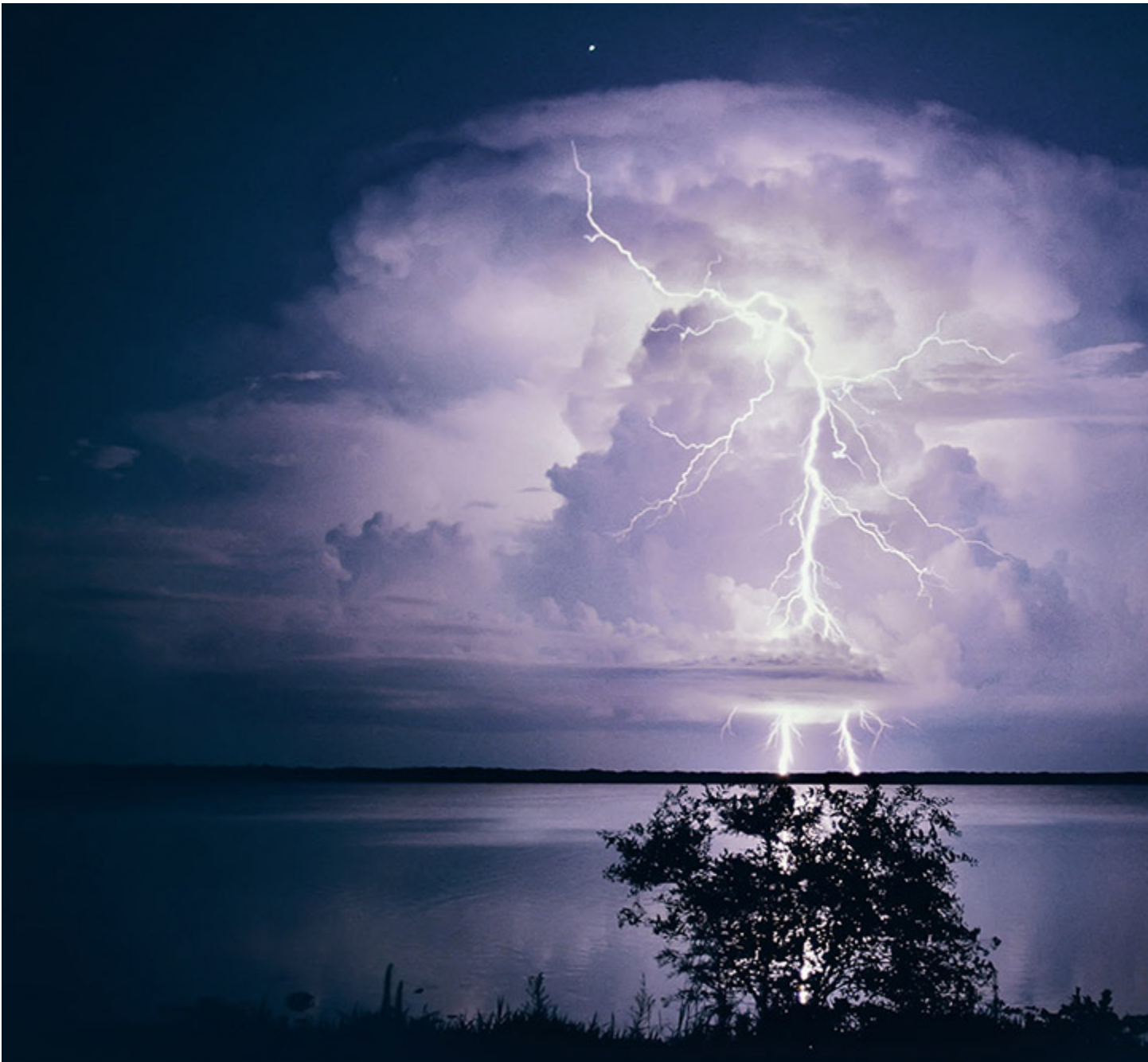
Veins of Fire • Newnans Lake •