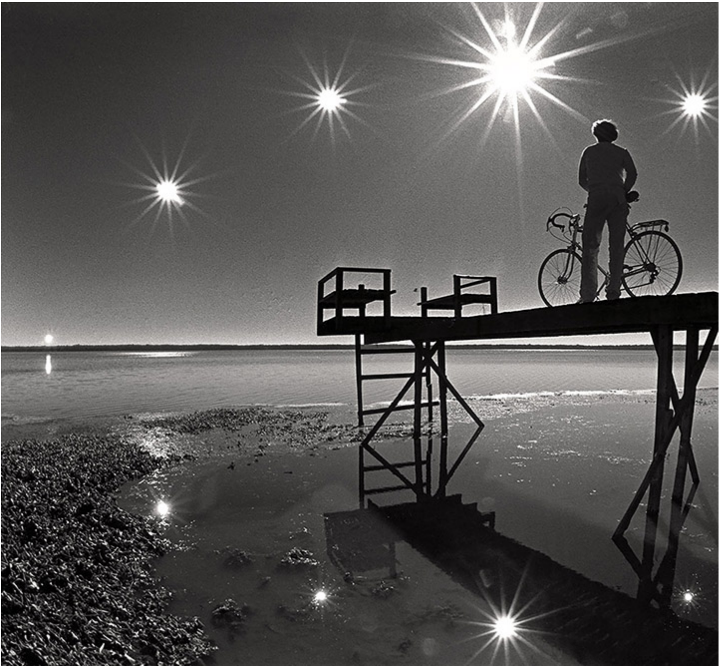
Day of the Longest Night/Winter Solstice 1981 • Newnans Lake • photo by John Moran