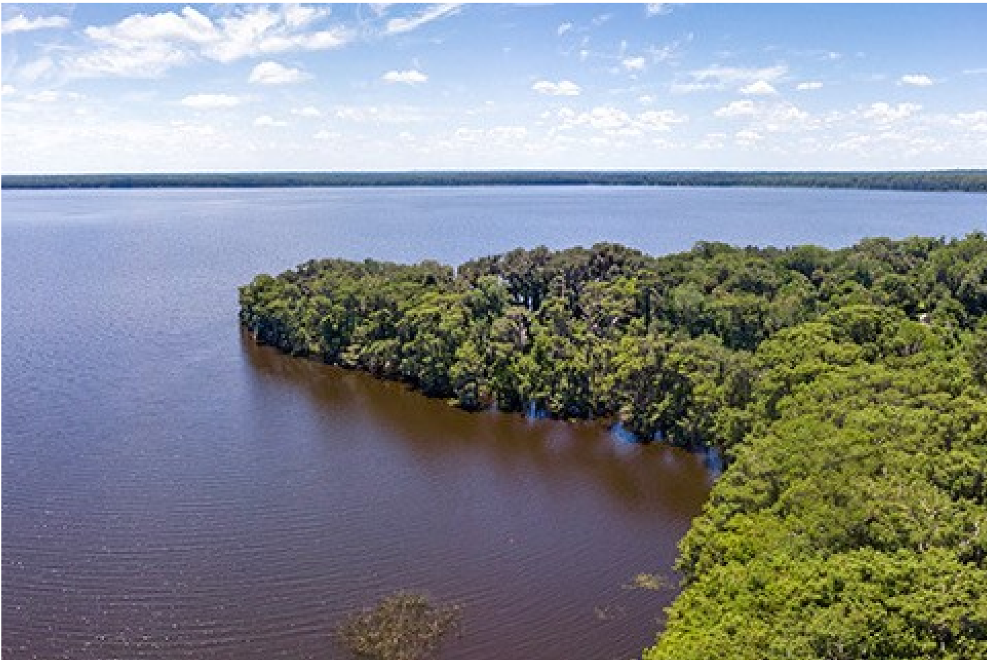
Where Wild Meets Scenic • Lakeshore Drive