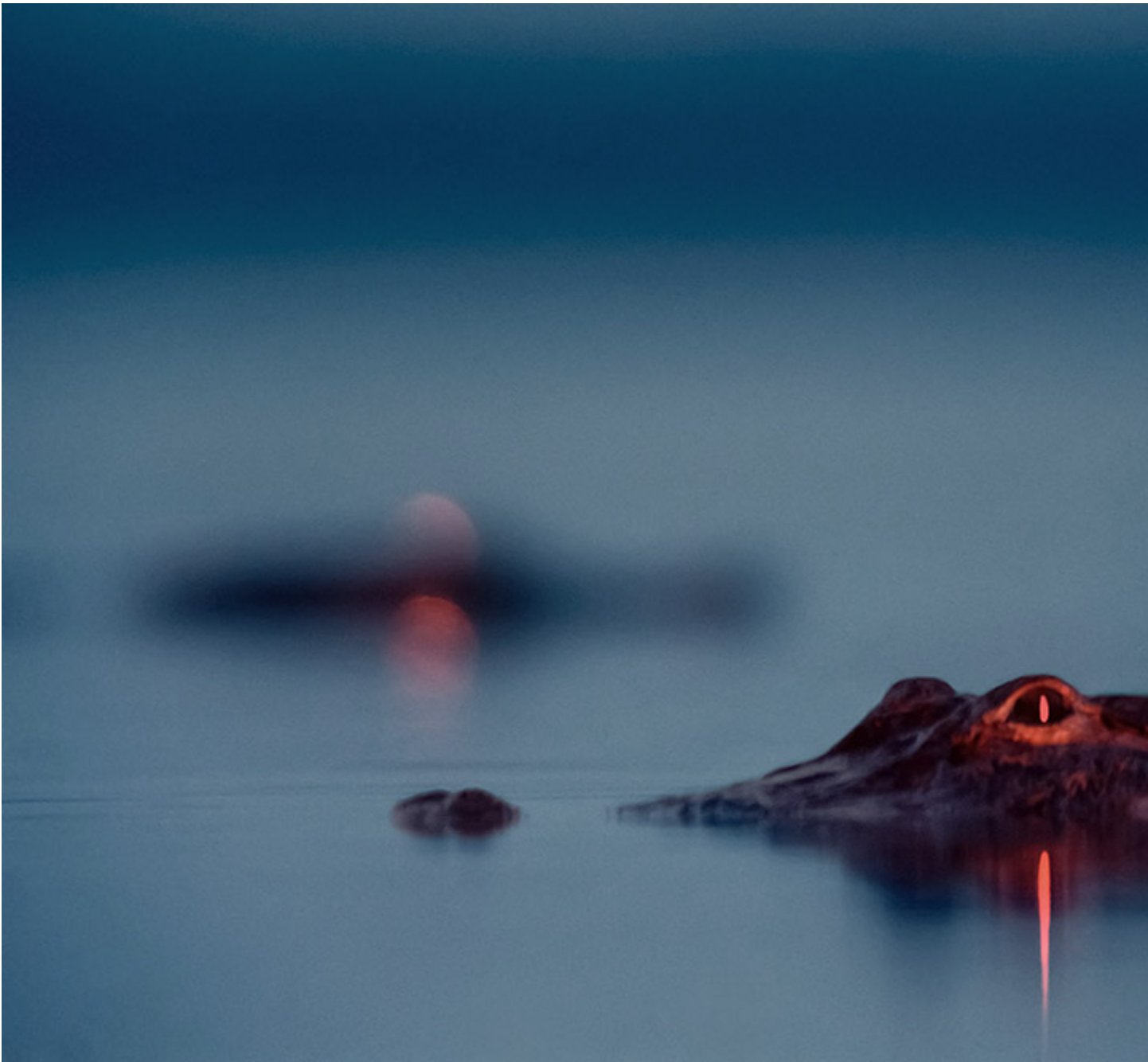
Eye of the Gator • Newnans Lake