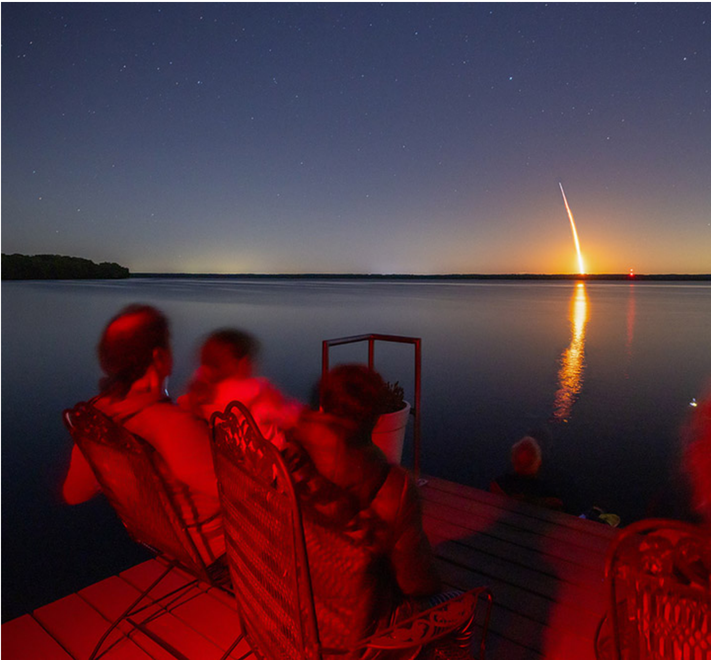
Light Up the Night • Newnans Lake