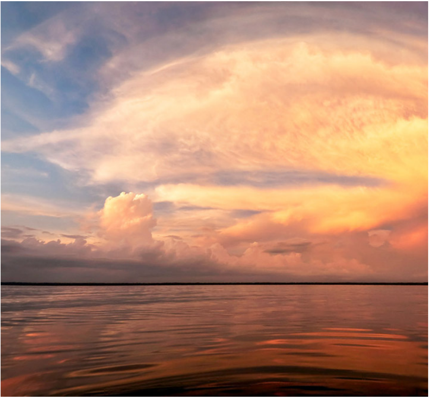
Study in Orange and Blue • Newnans Lake