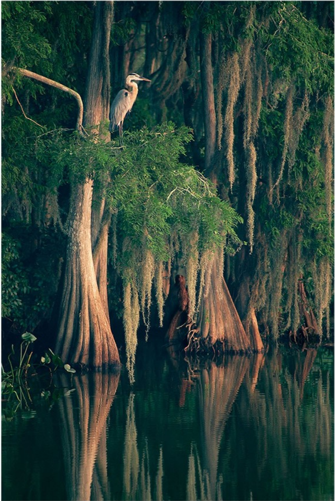
Sunrise Sentinel • Nezumans Lake