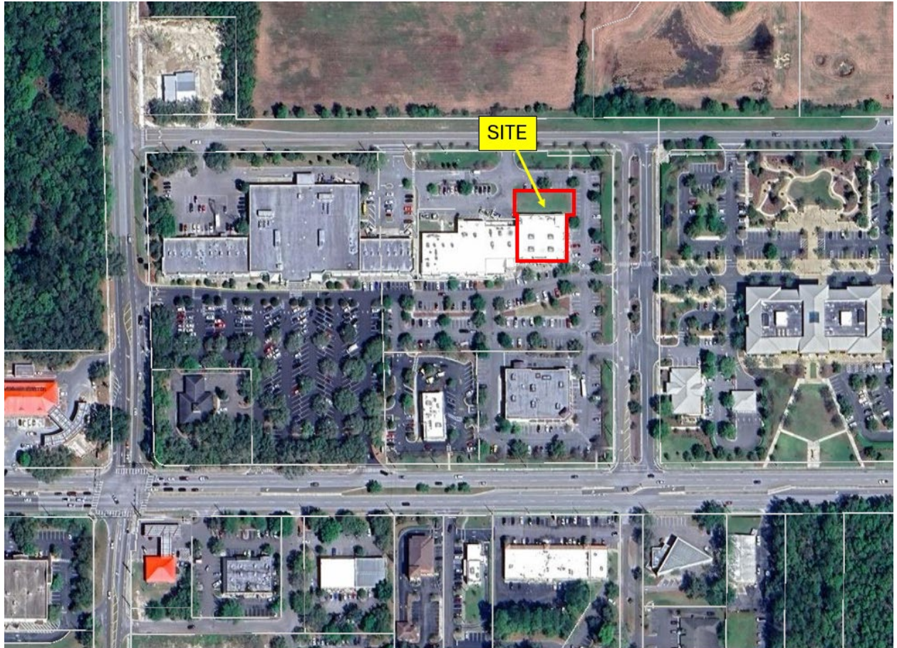
Figure 2: Close up of Ace Hardware site within the Jonesville Activity Center