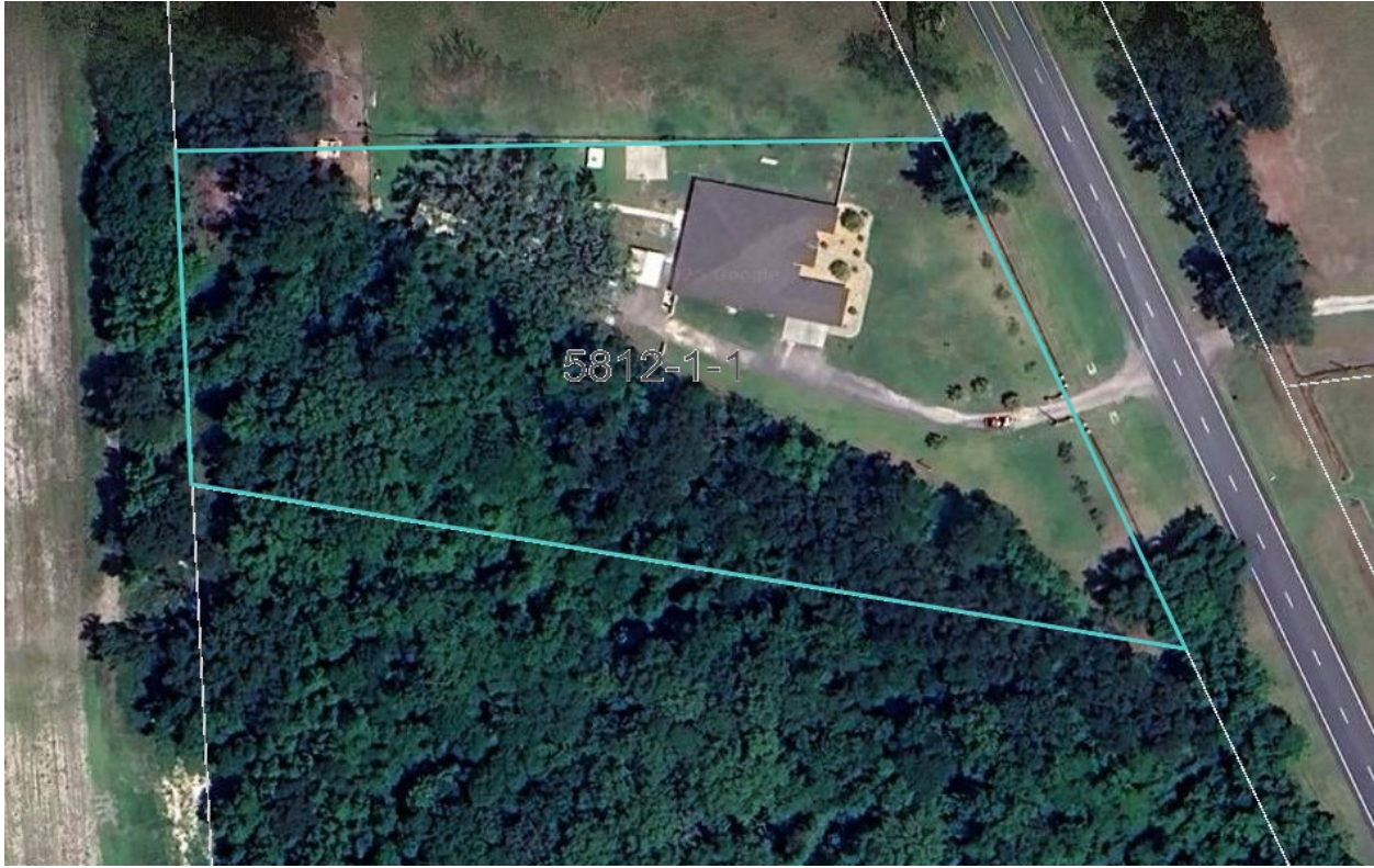
Figure 1: Aerial View of Subject Property