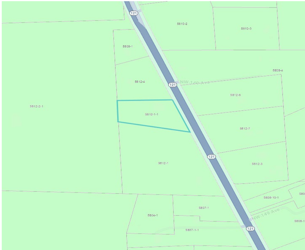
Figure 2: Zoning Map showing surrounding area with Agricultural Zoning District in green