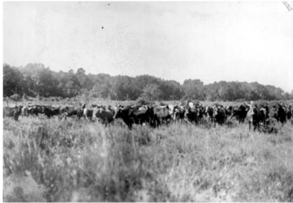
1700s Payne's Prairie – full of cattle

Credit: University of Florida, Payne's Prairie - Agricultural Experiment Station, October 1932