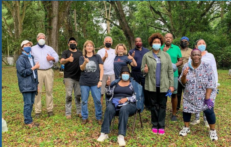
Pinesville Cemetery Cleanup led by Florida Public Archeology Network (FPAN)