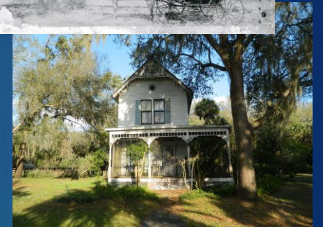
Axline House, Cross Creek, NR 2015