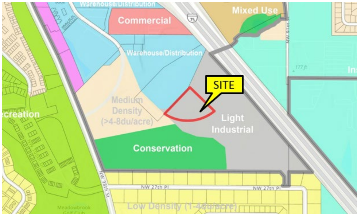
Figure 5: Future Land Use Map