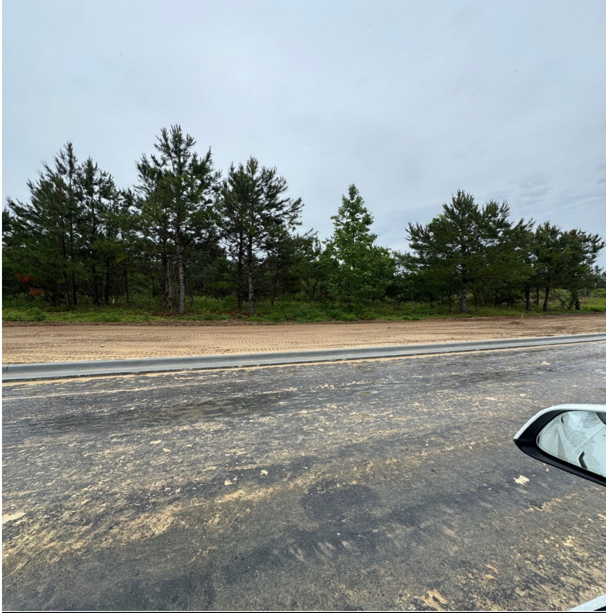
Figure 7: Photo of Project Site