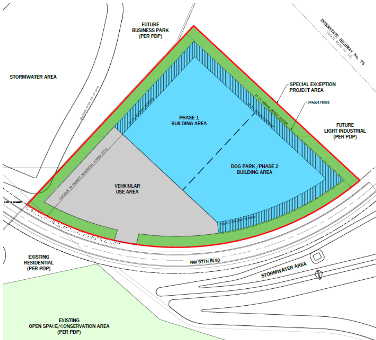
Figure 4: Proposed Site Plan

The proposed site is part of a larger development with a previously approved development plan. This plan already takes into account surrounding development with provisions for buffering at the perimeter of the (larger) site. In addition, the project parcel is surrounded by stormwater management facilities to the northwest and south as well as a large conservation area to the southwest across 97 th Boulevard. Due to the proximity of these undeveloped portions to the project site, staff is recommending that the Board approve a reduction in the buffers required per 404.44 of the ULDC. Buffering would only be required on the northeast perimeter as shown in Figure 4 and reflected in the conditions for approval of the special exception.