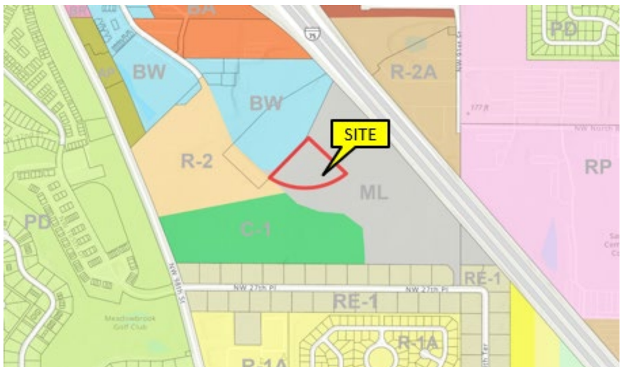
Figure 6: Zoning Map