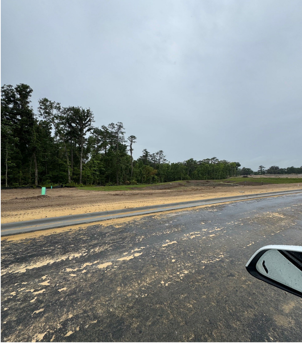
Figure 9: Photo of Retention Area and Conservation Area Southwest of Project Site