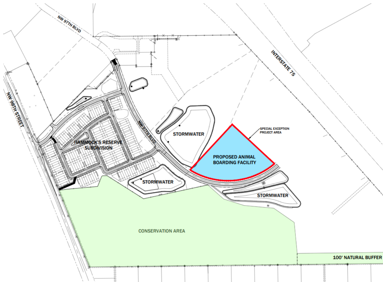
Figure 3: Proposed Master Site Plan

The development plan shows that the proposed site is buffered to the northwest and southeast by stormwater management areas. In addition, across NW 97 th Boulevard to the south, is a 20 acre plus conservation area for the overall development that will not see any construction activity. The land use and zoning to the northeast of the site is also light industrial and thus will see development of a similar nature.