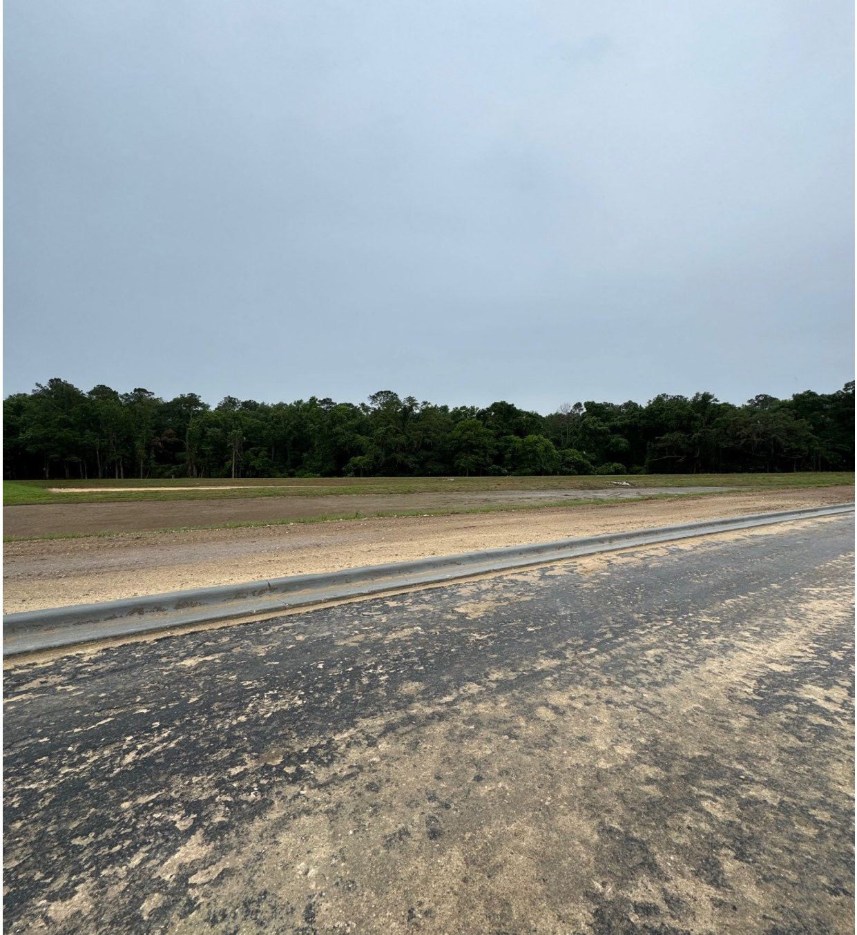
Figure 8: Photo of Retention Area Across from Project Site