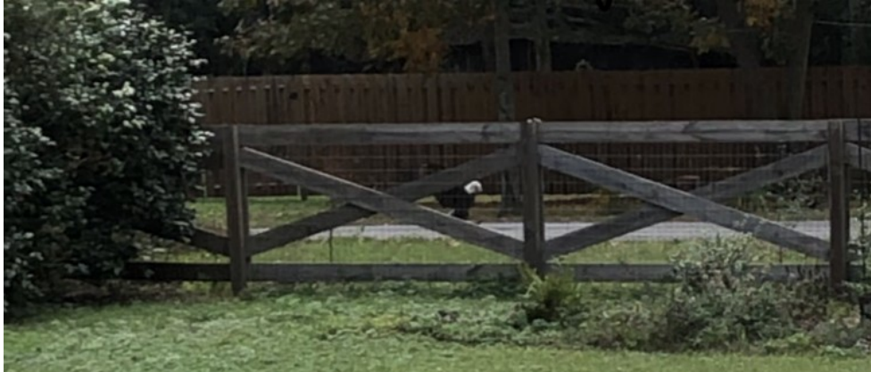
Bald eagle in the road on