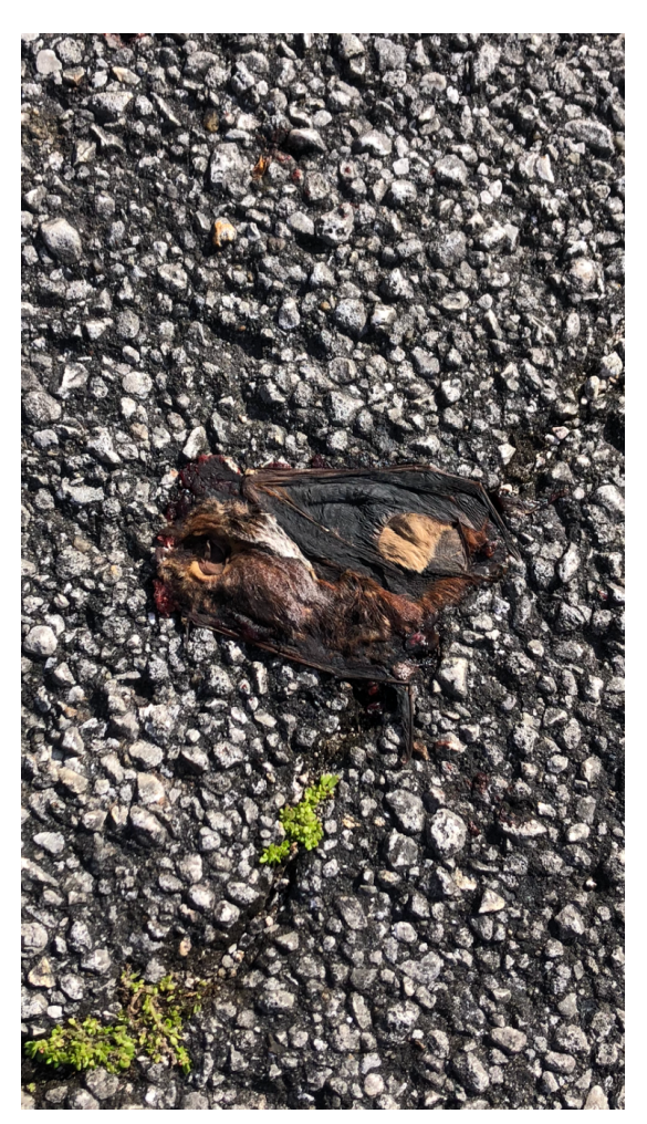
crushed bat on Lakeshore Dr.