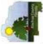
EXHIBIT 3: BID FORM/SCHEDULE OF VALUES