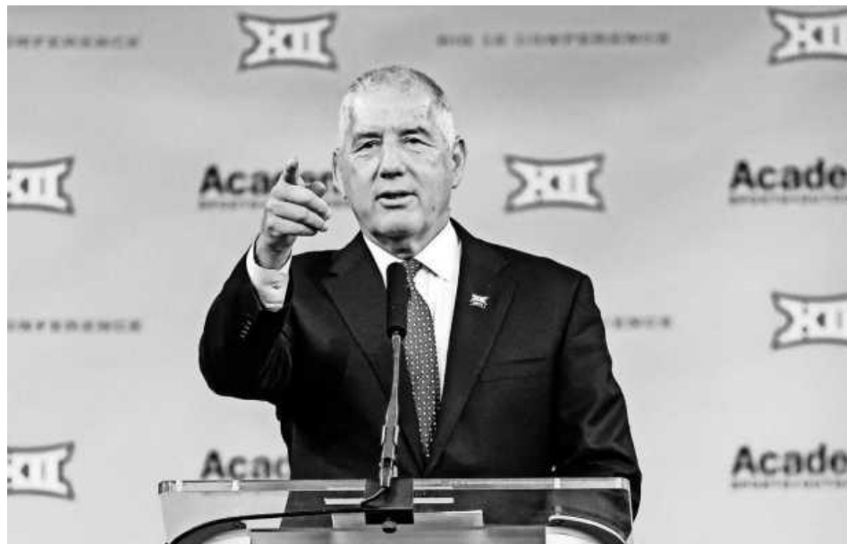
Big 12 Commissioner Bob Bowsby is optimistic about the conference's future.

For all those words, there aren't many specifics. I assume that's partially because the Big 12 doesn't have a lot of answers right now — the notion of the con-