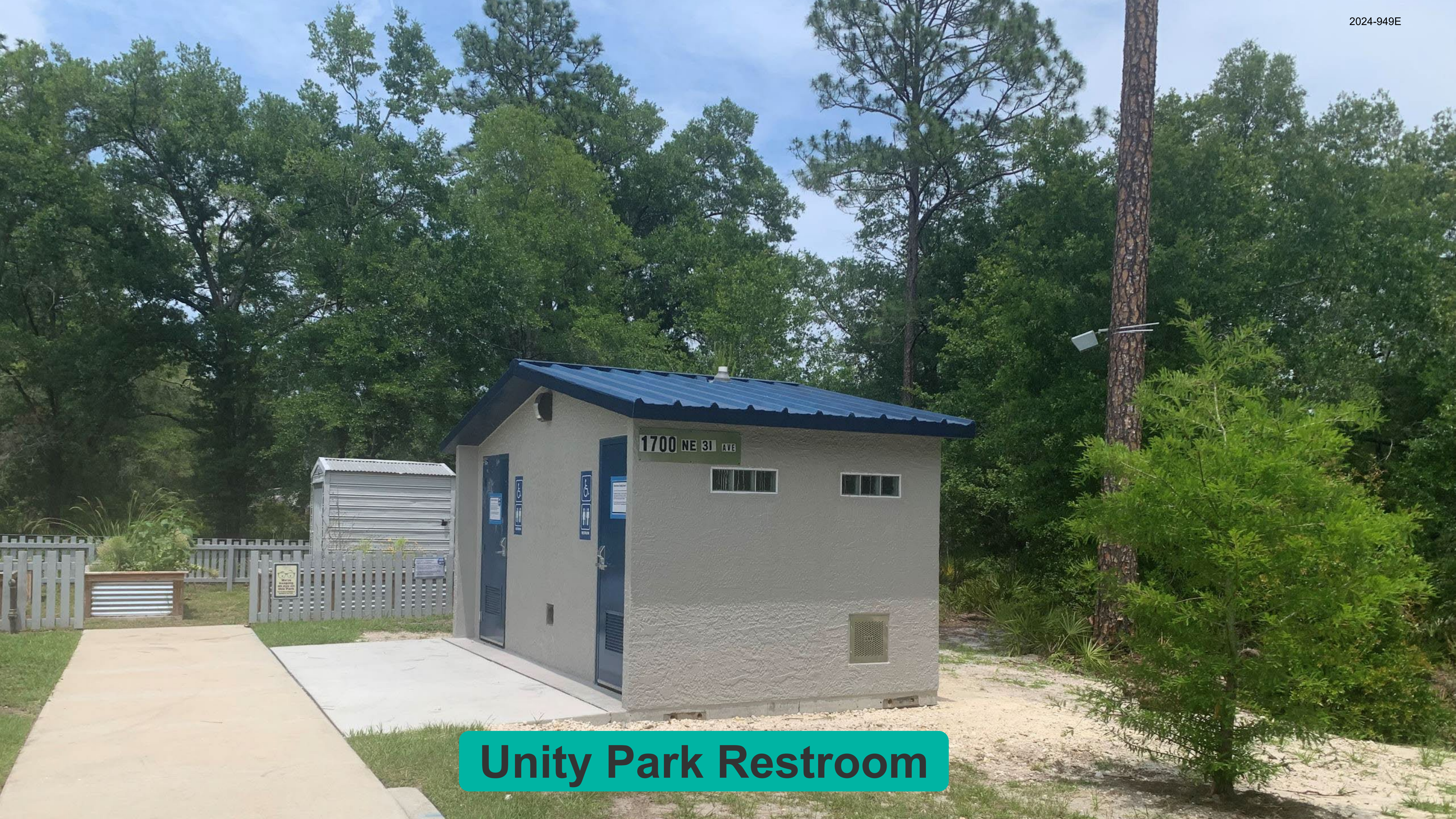
Unity Park Restroom