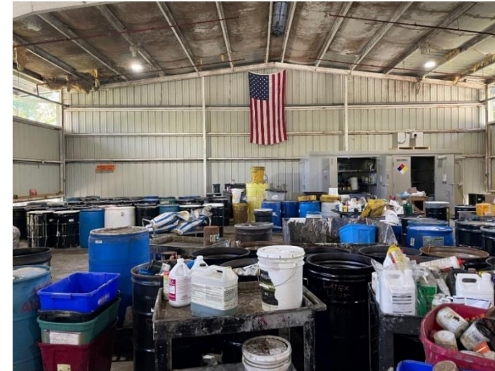
Hazardous Waste Collection Facility