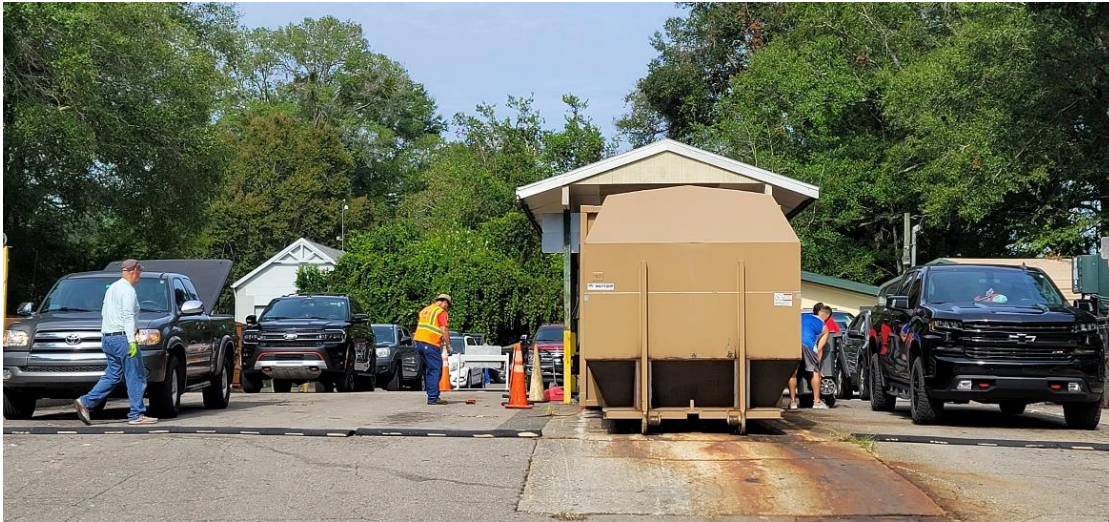
High Springs / Alachua Rural Collection Center

Problem : Lack of capacity at the Hazardous Collection Facility (Leveda Brown Environmental Park) and the High Springs / Alachua Rural Collection Center.