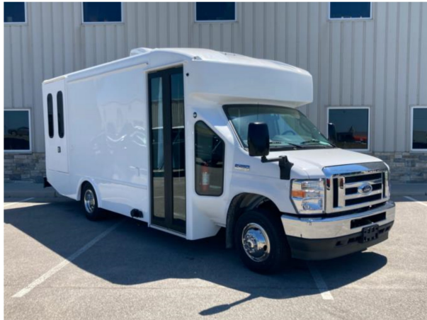
Picture is from a similar vehicle