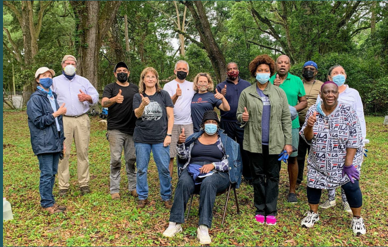
Pinesville Cemetery Cleanup led by Florida Public Archeology Network (FPAN)