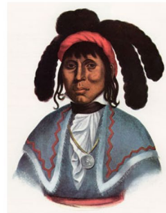
There is no known portraits of Ahaya Secoffee (Cowkeeper), King Payne or Bolek (Bowlegs). Above is Micanopy, Fourth Seminole Chief (1819-1849).