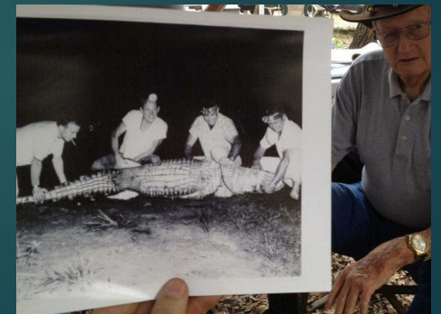
Above: Photos provided by Penny Wheat & Hutch Hutchinson; Shellie Downs from FB post