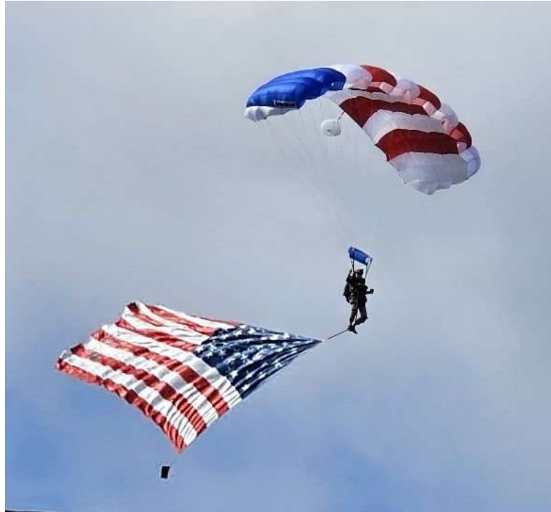
Palatka Skydive Bringing the American Flag to the Alachua County Veterans Day Celebration 2023