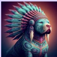
Furever Bully Love Rescue