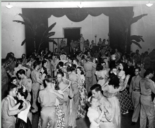
View showing servicemen dancing at the Gainesville Recreation Department's Service Center.

The Servicemen's Center offered R&R to soldiers from Camp Blanding and other nearby areas