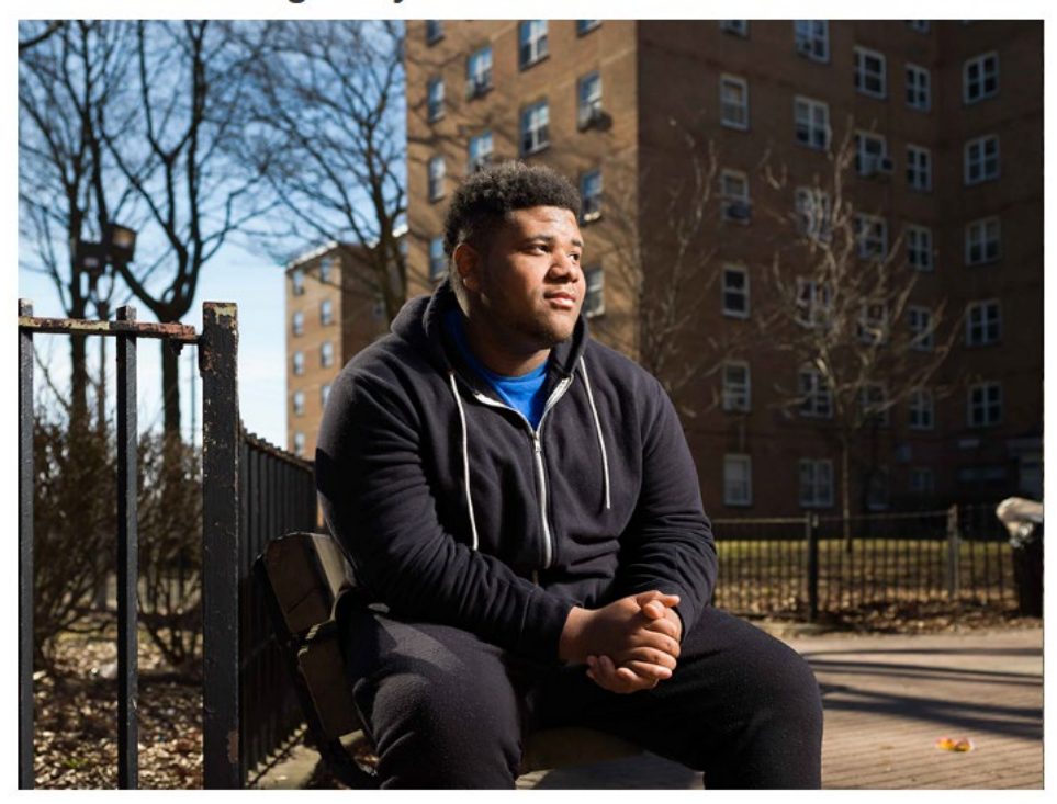
"I value my life"

"I know people who join gangs because they think being part of a crew will keep them safe. That just leads to violence and negativity."